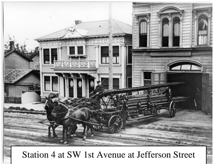
Station 4 at SW 1st Avenue at Jefferson Street

An Extraman was a volunteer that worked alongside the paid firefighters of the day. From 1883 to 1904, the Portland Paid Fire Department deployed one shift of firefighters, who worked 6 days in a row followed by 12 hours off. Each company had 3 to 4 paid firefighters supplemented by 4-8 Extramen, who were typically vying for a paid position should one open up.